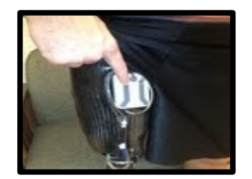
10. If equipped with electronic pump, turn on.

TIP: If the socket doesn't feel comfortable, you will need to take the inner and outer socket off. Then rotate the inner socket so the outer socket seats into the design comfortably.