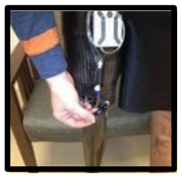
8b. Check lock by pulling up on residual limb.